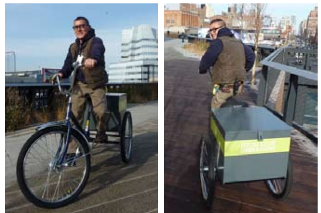
Worksmen Mover Series Tricycle with Cabinet