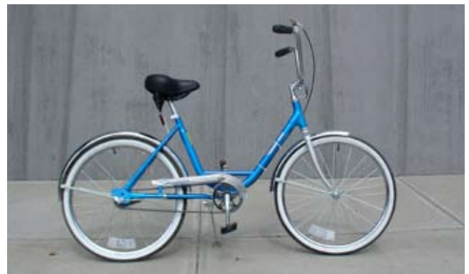
Worksmen UniSex Heavy Duty Comfort Cycle