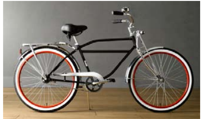
Worksmen Classic Heavyweight Cruiser

It is one thing to support a green lifestyle and another to have it be part of a company's operating principles. Worksmen is proud to be the first manufacturing facility in New York City to install solar energy panels to power its factory. In addition, the Worksmen facility has been retrofitted with high efficiency lighting and practices energy-wise management with programs such as lights-out breaks and lunch periods.