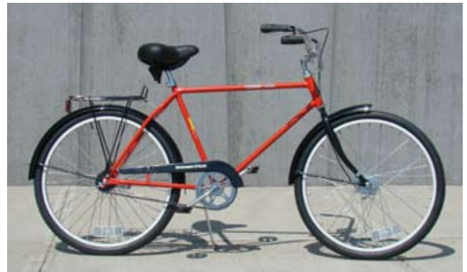
Worksmen Midweight Commuter