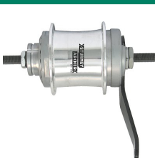
C8B2: 2-Speed Duo-Matic Shift