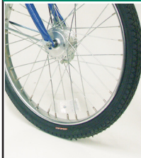
K26MW: Kevlar Reflective