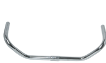
24" Std H4: 28" Cruiser H5A: 20" City Bar