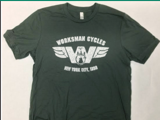
Grey with "Flying W" Logo