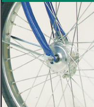
C6: Front Drum Brake