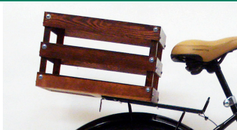
4919WCRT New! Wooden Crate w/rack