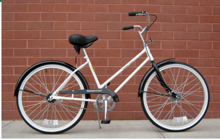
Women's 18" Step-Thru Frame shown with optional painted fenders, alloy rims and front drum brake