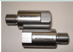
7217-EXT Alloy Pedal Extenders