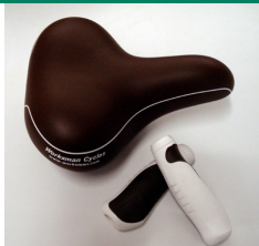
N19BRW: Brown & White Sport Saddle & Grips

New! Brooks Saddles, Grips & Accessories from England