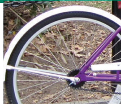
PF2: Painted Steel