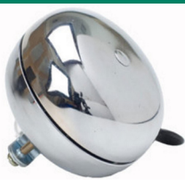
P2: Classic Ding Dong Bell