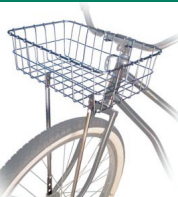
G1: 18" x 13" x 6"