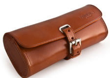
75-B200210 7/5 Challenger Tool Bag