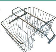
Rear Side Baskets