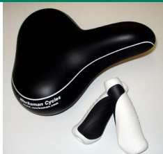
N18BKW: Black & White Sport Saddle & Grips