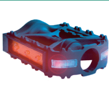
P18: Flashing LED