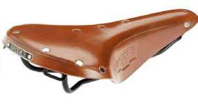
N19-BFS-H: B17 Saddle, Honey