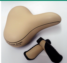
N19CRM: Creme & Black Sport Saddle & Grips