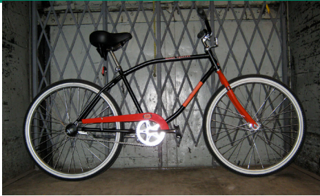
Men's 18" Curved Top Tube Frame shown with optional whitewall tires and custom painted chainguard and fork