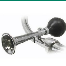
P3: Classic Squeeze Bulb