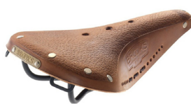
N19-BFS-DT: B17 Saddle, Aged