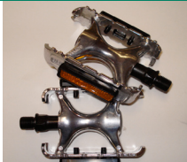
L7218U: Steel Trap