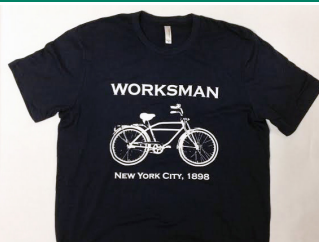
Navy with Retro Cruiser