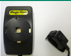
3973: Electric Mega Horn