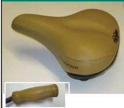
N19TL: 8" Leather Saddle w/ matching grips