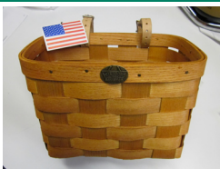
612MODHPN Peterboro Wicker Basket