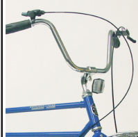
H2: 9" Hi-Rise