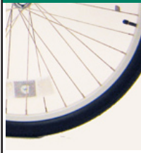
AR26MW: Alloy Rims