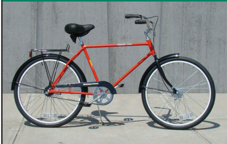
Men's 20" Diamond Frame shown with optional painted fenders, alloy rims and front drum brake