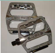
N18: Oversize Alloy Platform