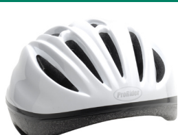
P19: Assorted Colors