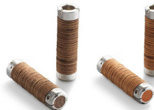
N19BGH/T Slender Grips

New! Brooks Saddles, Grips & Accessories from England