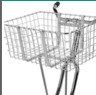
G2: 21" x 15" x 9"