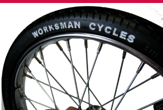
L4A Worksman Airless Technology Tires