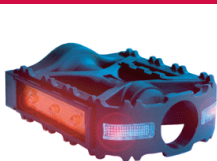
P18: Flashing LED No batteries ever!