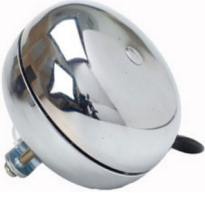
P2: Classic Ding Dong Bell