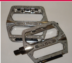
N18 Oversize Alloy Platform