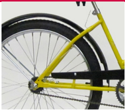
Black Polycarbonate (std)