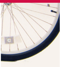
WTC Alloy Rim w/SS Spokes