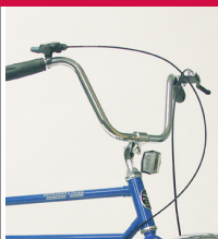
H2: 9" Hi-Rise