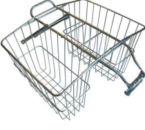
G4: Rear Side Baskets