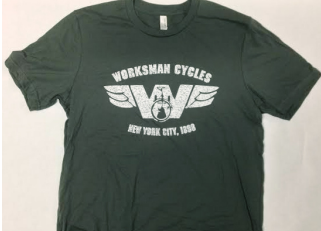
Grey with "Flying W" Logo