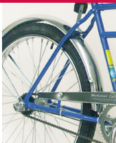
FC26CP: Chrome Steel