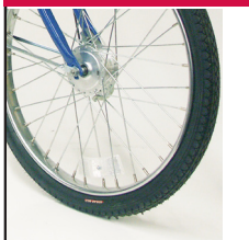
K26: Blackwall Kevlar