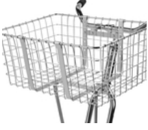
G2: 21" x 15" x 9"