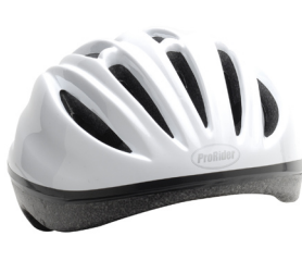
P19: Helmet (asst'd colors)

Looking for even more choices? Please see our "Design Your Own Cruiser" page.