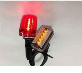
P122: LED F/R Light Set