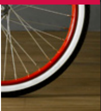
PW2: Painted Rims