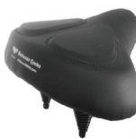
Standard 9" Double Sproing