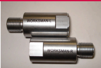
7217-EXT: Alloy Pedal Extenders