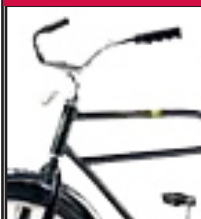
24" Cruiser (std.)