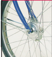
C6: Front Drum Brake