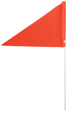
P8: Safety Flag