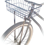
G1: 18" x 13" x 6"