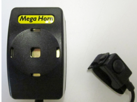
3973: Electric Mega Horn