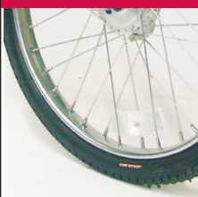
WTC Steel Clincher Rim (std)