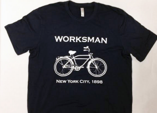
Navy with Retro Cruiser