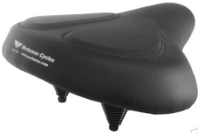
N19: 13" X-Wide Comfort