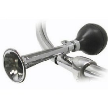
P3: Classic Squeeze Bulb