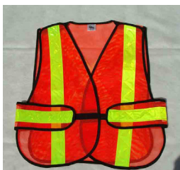
3040: Safety Vest