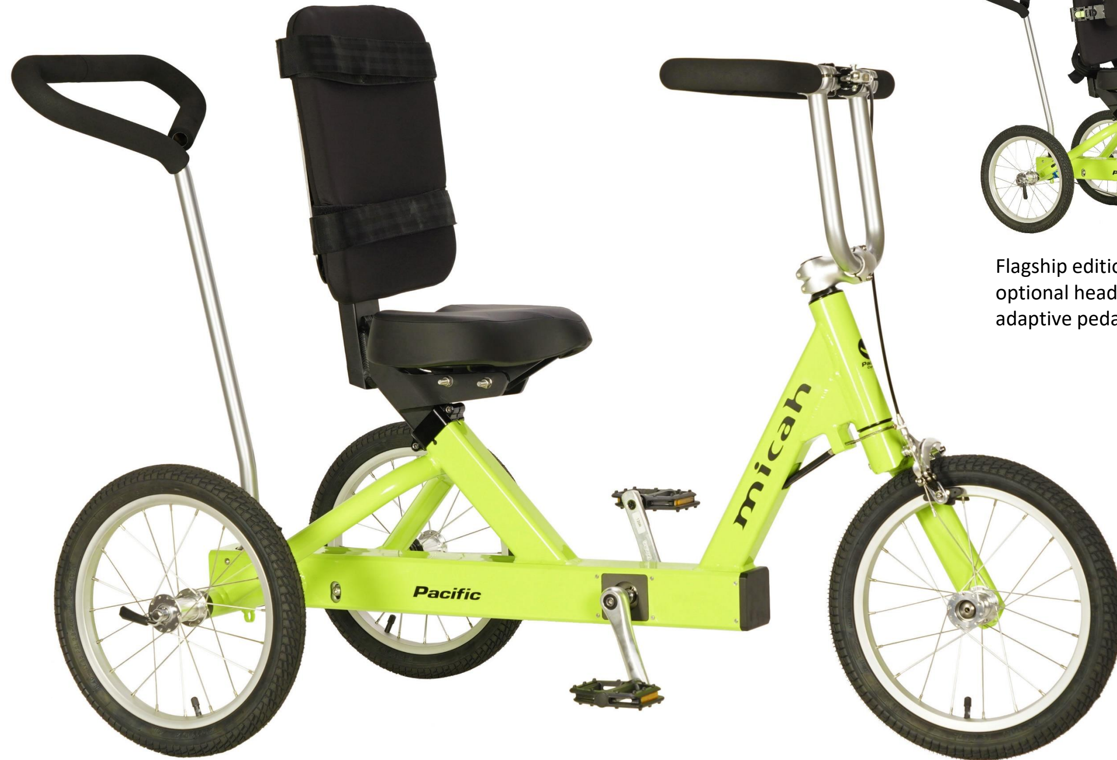
Lohas edition: Standard setup with basic seat and assist steering rod