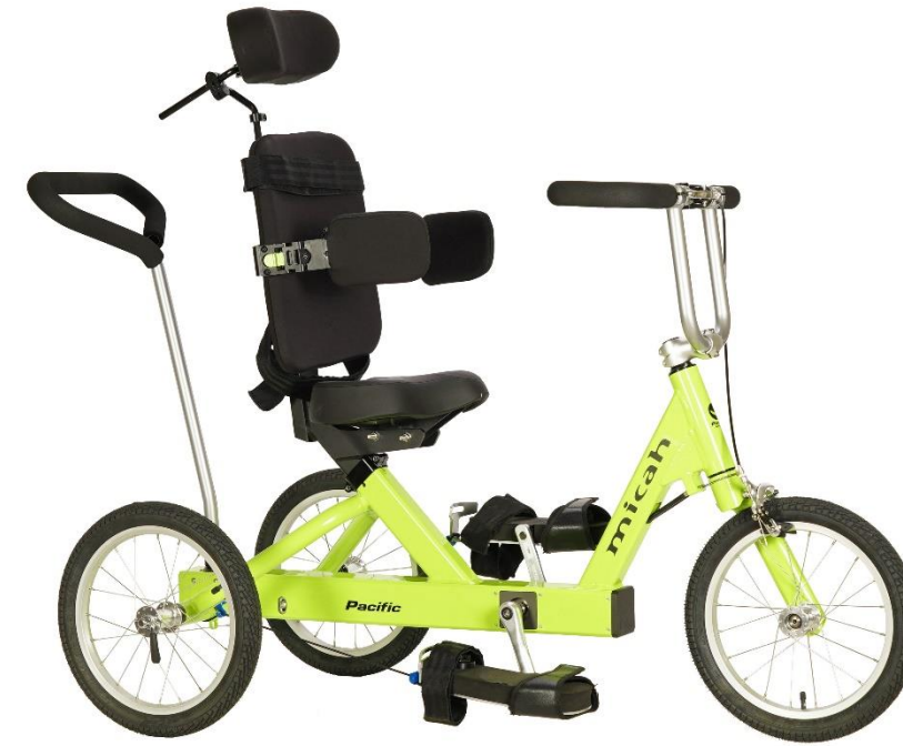
Flagship edition: Complete setup with optional headrest, side support and adaptive pedals.

The MICAH tricycle is the perfect companion for young adults and children with cerebral palsy. Not only is riding the MICAH fun, but it also promotes growth and learning while providing a safe way to build confidence and independence.