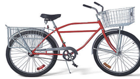
Worksman INB Industrial Bicycle